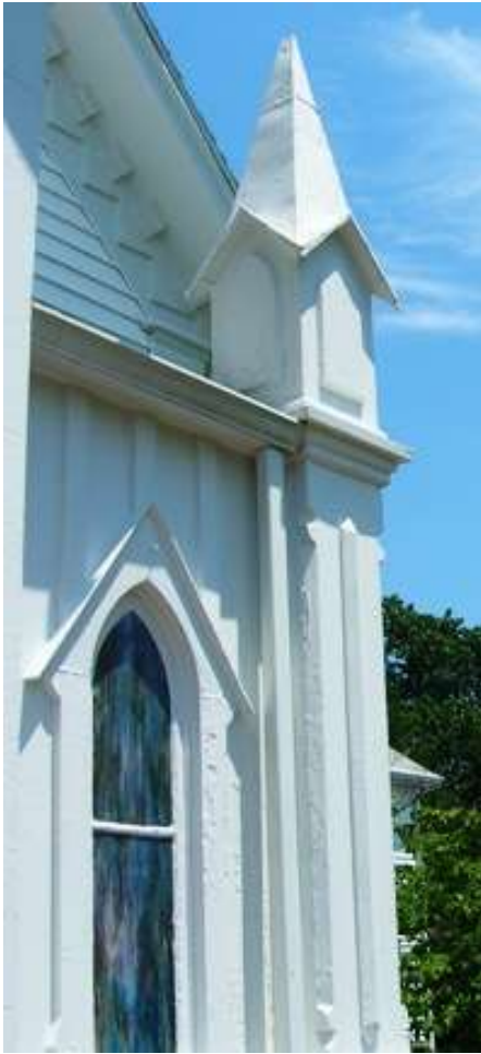
Cold Spring Presbyterian, Bristol